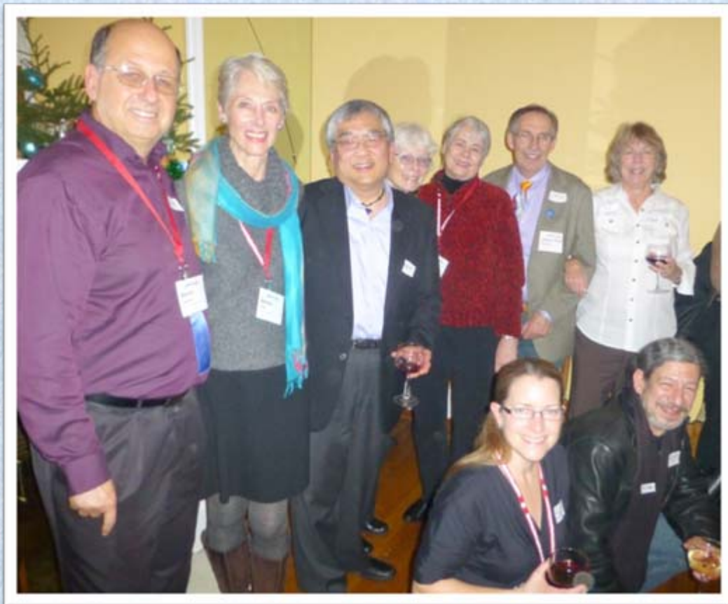
A few of the past and future NAPA presidents pose at the members' reception during the 2014 AAA meeting

Photos and audio from the 30 th anniversary activities will be uploaded to various NAPA media in coming months: workshops, networking, special sessions, the Careers Expo, T shirts, birthday cake and a special members reception were all a part of the fun!